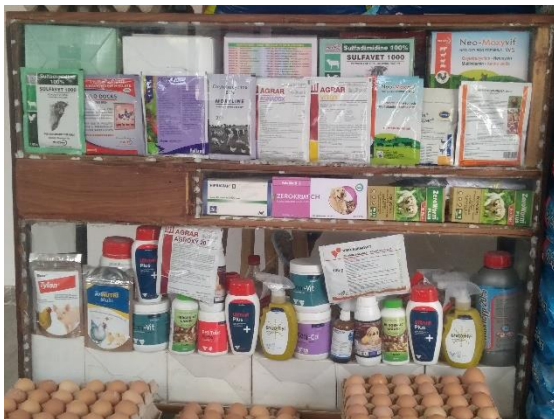
Photo 1. Drugs retailing in Maputo Province, 2020